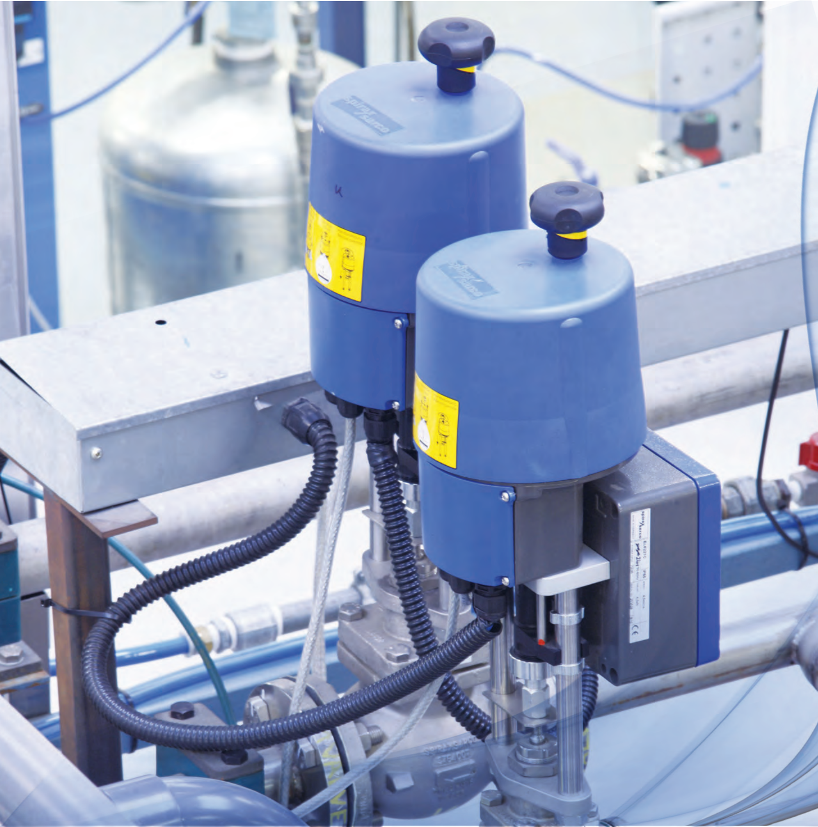
Some of the products may not be available in certain markets.